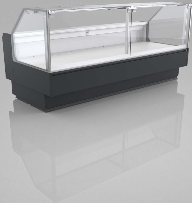
Lingtren LDLI-37 2500 GSL

GSL — glass | single, straight | lift up